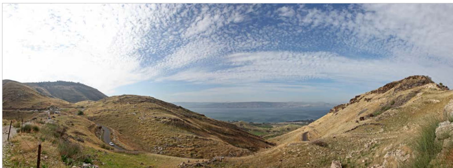
Fig. 1.4 A panorama view from Sussita saddle-ridge towards the Sea of Galilee.