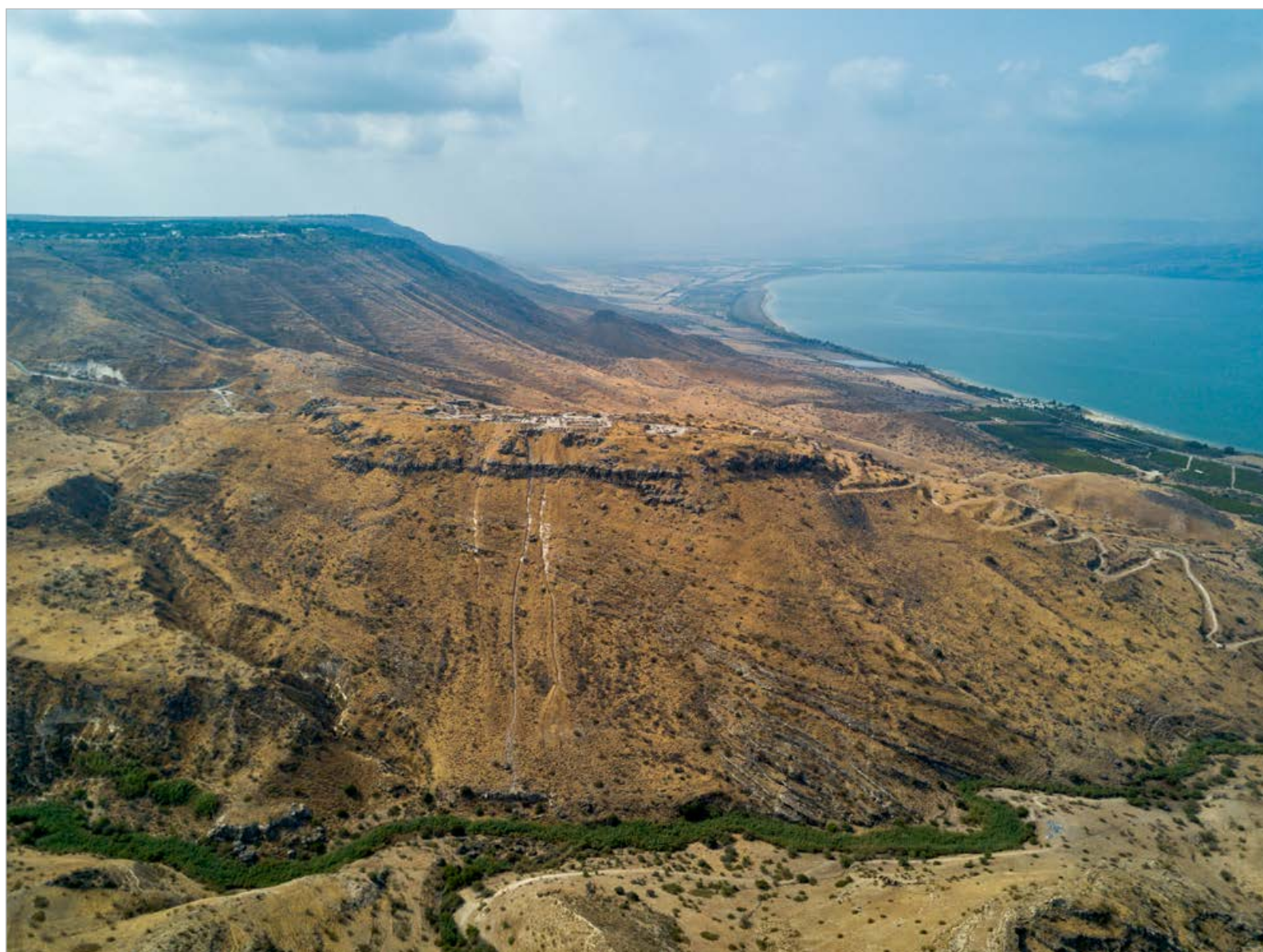
Fig. 1.2 Mount Sussita, with the Ein-Gev stream flowing below it and the Sea of Galilee to its west.

This second, and last, volume to summarize the first twelve years (2000–2011) of research at Hippos (Sussita) of the Decapolis is published four years after the publication of the first volume in early 2014 (Fig. 1.1). 1