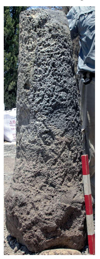
Fig. 2. Milestone IMC 627

The addition ofthe main rank IMP(ERATORI) referring to the emperor Maximinus Thrax corresponds to the regular form. Assuming uniform beginnings of lines, the letters IMP should appear in a preceding line, which is broken off.<sup>2</sup> After line 8, there seems to be no space left to insert the obligatory titulature CAESARI F(ILIO) AVG(VSTI) N(OSTRI).