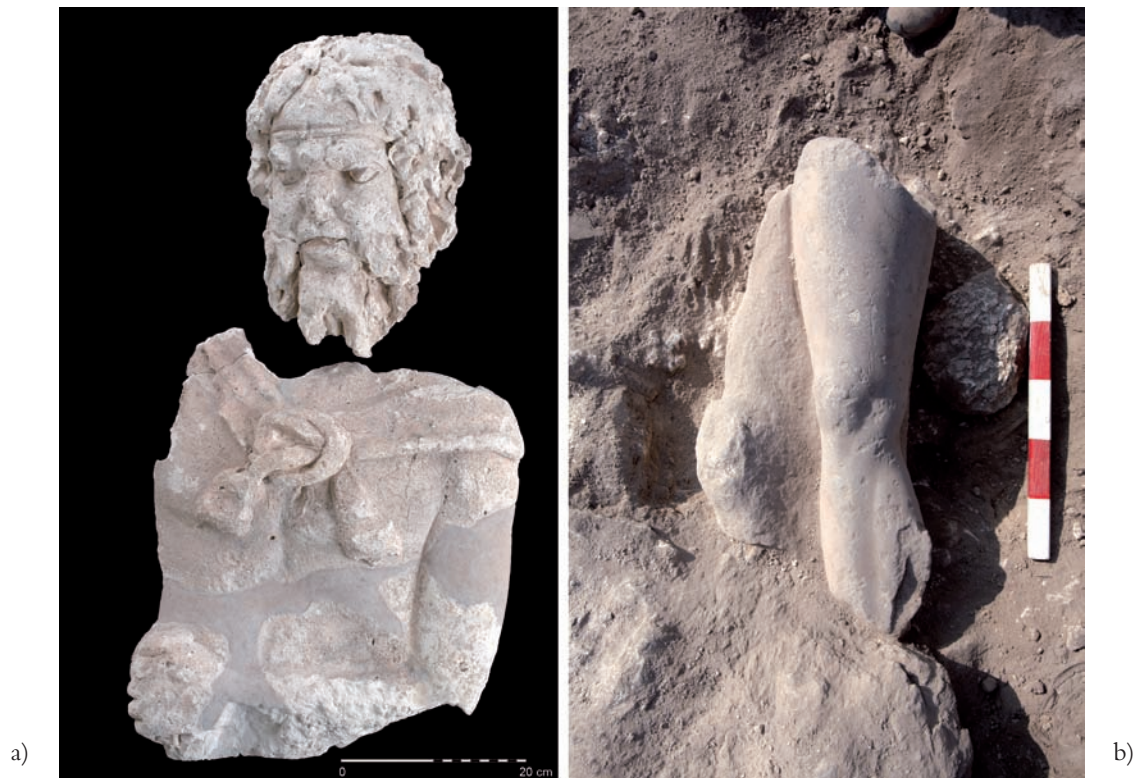
Fig. 11 a-b) Figural art from the Southern Bathhouse

The only other figural art found in the bathhouse are two pieces of statues in white marble. The first is a fragment of a leg of a muscular body (B.7227, Fig. 11b). The second is a