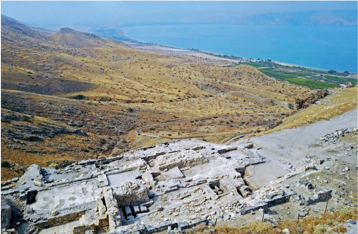
Fig. 4. The vista from above the Southern Bathhouse. View towards south-west