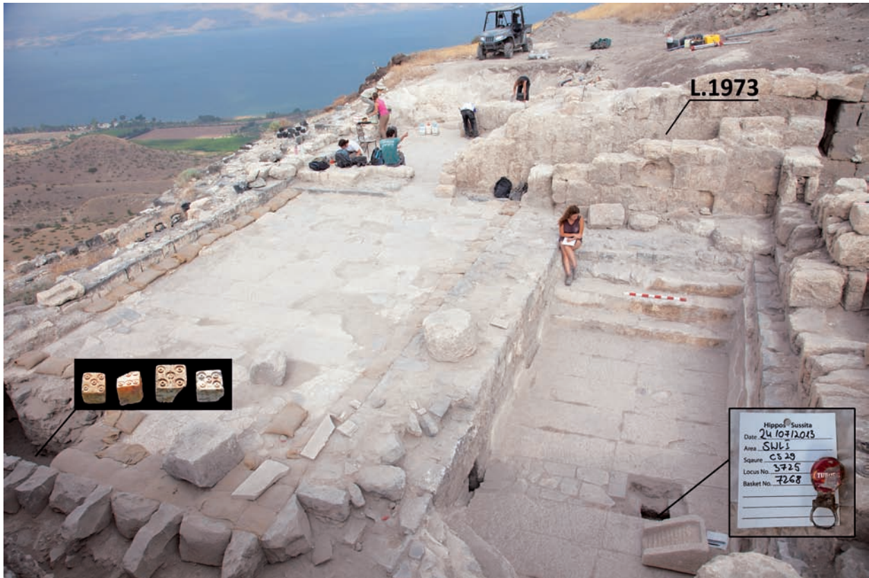
Fig. 6. Hall II. Note the piscina, the benches surrounding the floor (covered with earth bags), the finds from the drain under the hall, and the indicated location of L.1973. View towards west