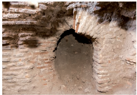
Fig. 9. Hypocaustum with brick arches supporting the suspensura, a. in the western side of Hall VI, view towards north, and b. in the western side of Hall V, view towards north