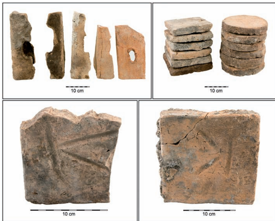
Fig. 10. Ceramic building materials found in the Southern Bathhouse