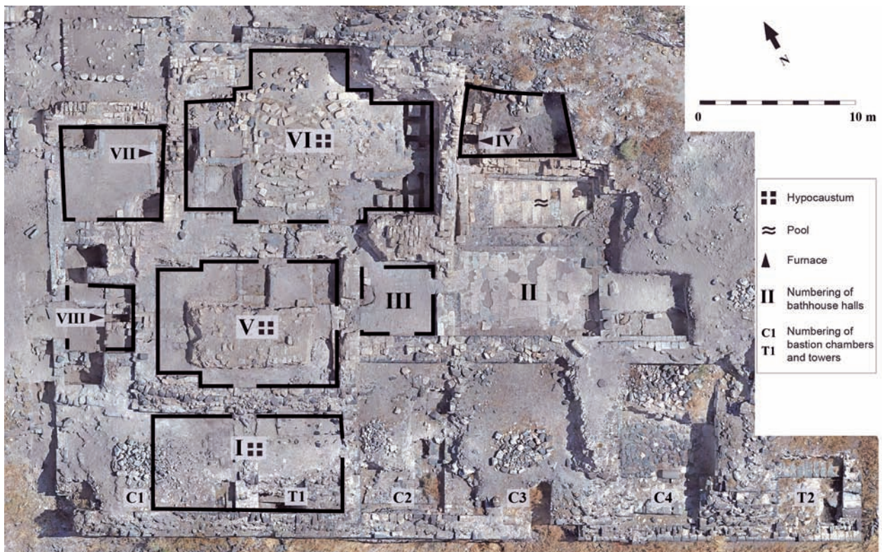
Fig. 3. Photogrammetry of the Southern Bathhouse with excavated halls indicated