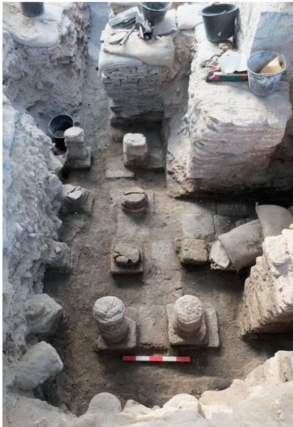
Fig. 8. Hypocaustum in the south-eastern part of Hall VI. View towards east