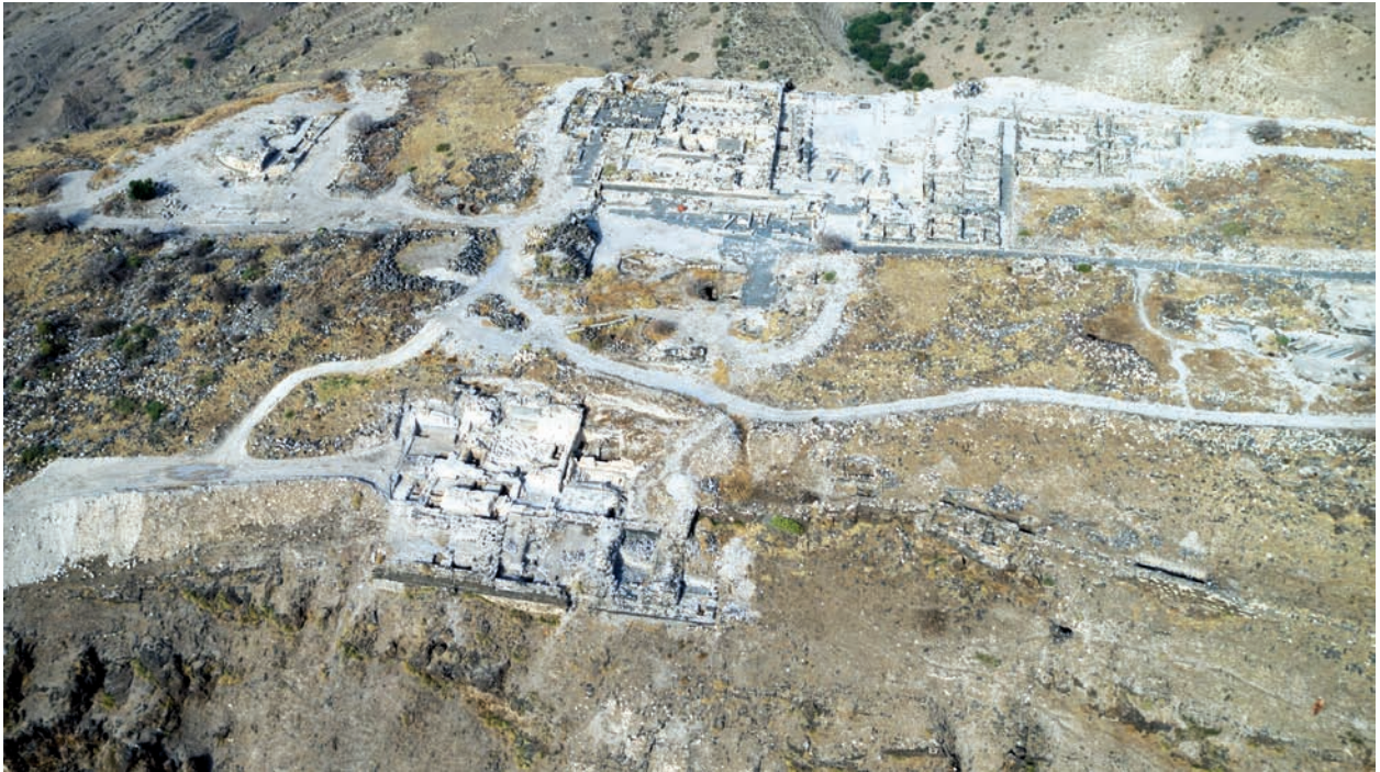
Fig. 2. Aerial view of the southern slope with the Southern Bathhouse and the bastion. Note the forum up and behind the bathhouse, and other surrounding excavation areas. View towards north