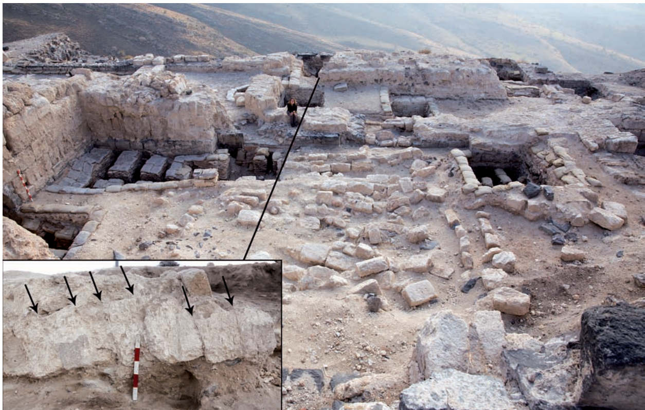
Fig. 7. View of the heated halls of the Southern Bathhouse from the northern wall of Hall VI. Note the collapsed ashlar in Hall VI and the pattern of collapsed vault in Hall V. Main photo view towards south, side photo towards west