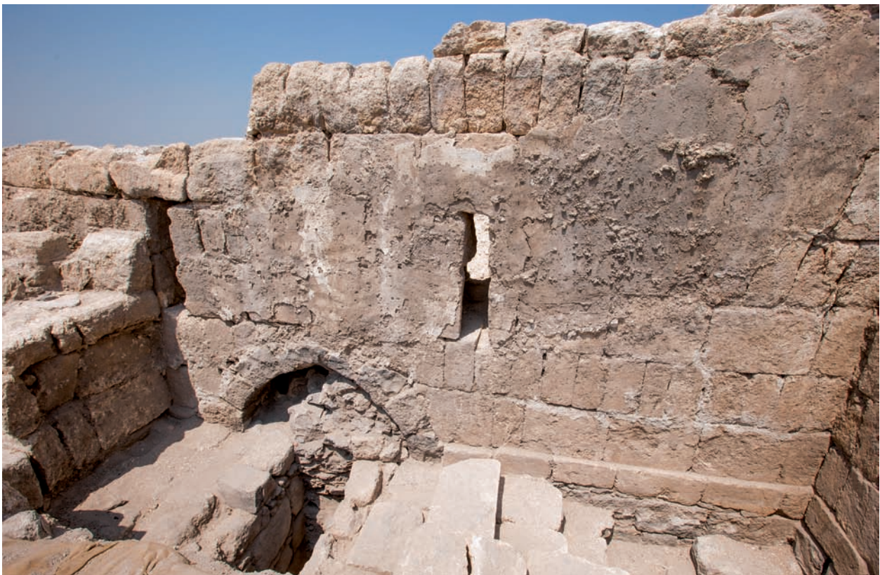
Fig. 5. Hall IV, the furnace for the hypocaustum of Hall VI. Note the construction of the two parallel furnace walls, the basalt arch of the wall above them and two symmetrical openings on the sides of the arch. View towards west