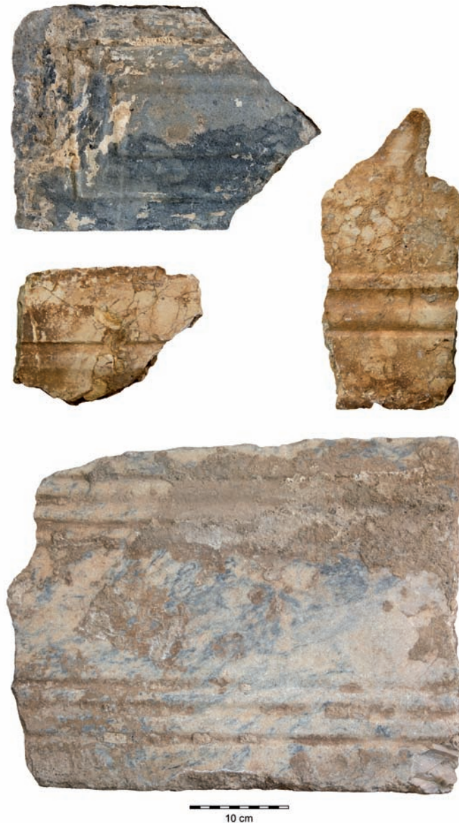
Fig. 12. Examples of fragments of marble and limestone slabs recovered from the heated halls

The floors and walls of the bathhouse were covered with revetments of imported marble and limestone of many different types, some smooth and some with moldings. The smooth slabs measure 140 \times 60 cm, as attested by some found in situ in Hall II. The debris of the hypocaustum contains many small pieces of the slabs, the ones that were not considered worth removing in later times (Fig. 12). The revetment was held to the walls by means of clamps, a number of which have been recovered as well.